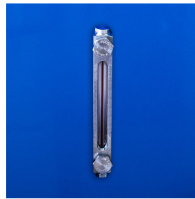
Liquid Level Indicator - Included