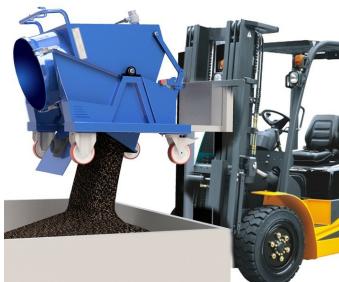
Self-Dumping Overturning Hopper (SDOH) - Included