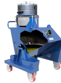
4D-300L (SDOH) Cut-Out