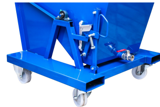
Ø1" (Ø25.4 mm) Manual Drain Valve - Included