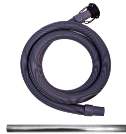
1.5" x 10' Crushproof Suction Hose and 24" bulk pickup wand included