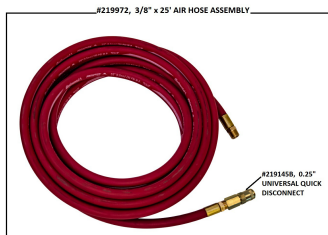
AV1-55 Optional Air Supply Hose