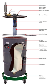
AV1-55 System Overview