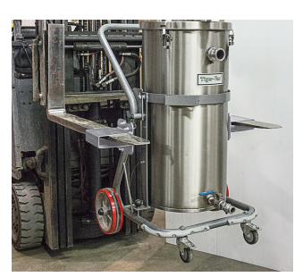
Optional Forklift Lifting Rails available