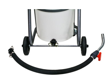
HOGOIL Drain Hose Assembly - Included