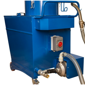
Discharge Pump - Electrically Operated - Optional