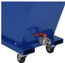
Ø2.5" (Ø64 mm) Manual Drain Valve - Included