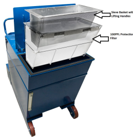
Sieve Basket and 100 PPL Protection Filter - Included