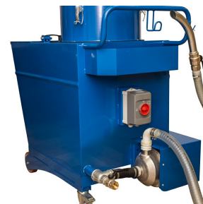
Discharge Pump - Electrically Operated - Optional