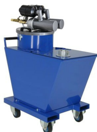
CS-300L (COOLANT/OIL) TWIN VENTURI