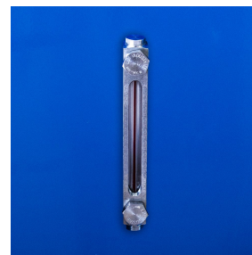
Liquid Level Indicator - Included