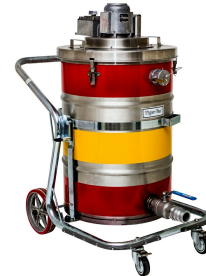
EXP1-55 (TC) TE