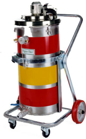
EXP1-25 (TC) TE