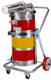
SS-25 (TC) TE