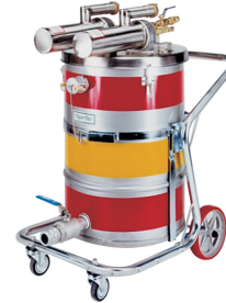
SS-55 (TC) TE TWIN VENTURI