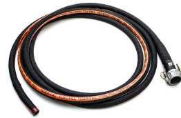
Nitrile Suction Hose - Included