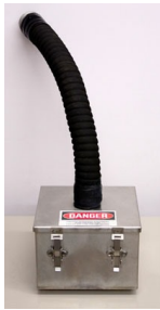
Activated Carbon Cartridge for TE Series - Optional