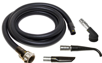
3D Tool Kit for 2" camlock suction inlet - included