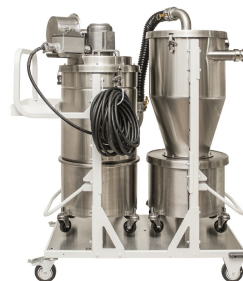
EXP1-20 DT (PRS-HEC) RE HEPA Sideview 2