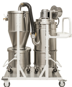
EXP1-20 DT (PRS-HEC) RE HEPA Sideview 1