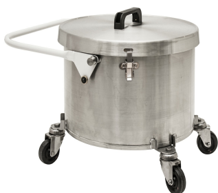
Extra recovery tank with lid to facilitate the refresh and re-use of the recovered powders (Part# 223001-ASM1) - Optional