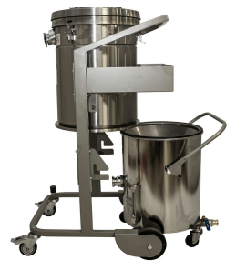
Mini Enhanced - Side View with detachable tank