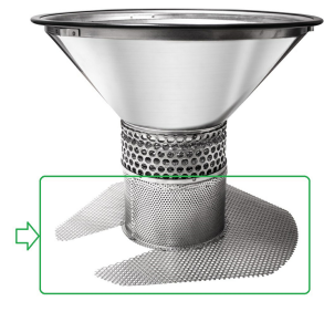
#228093 - Depressor cage for conductive wet recovery bag - optional