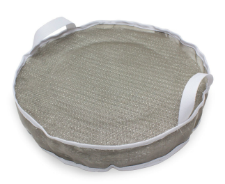
Mist Arrester Pack - Included