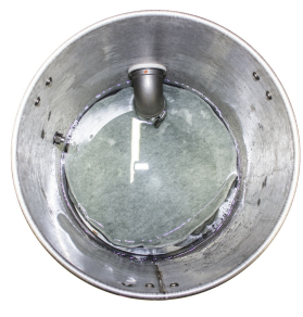
Conductive "wet" recovery bag - Included