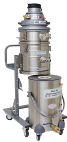
C-10EX (IT-63L) CFE SK HEPA with Recovery Tank removed