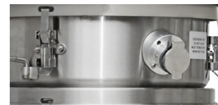
Degassing Vent - Included