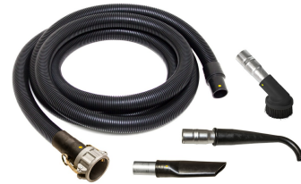
3D Tool Kit for 2" camlock suction inlet - included