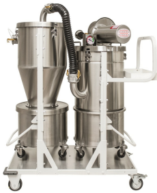
SS-20 DT (PRS-HEC) RE HEPA Sideview