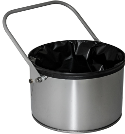
C-10EX DT (MFS) Recovery Tank and Poly Liner