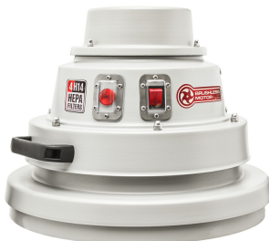
Longer Life Brushless Motor Available (always with 4 x H14 HEPA filters)