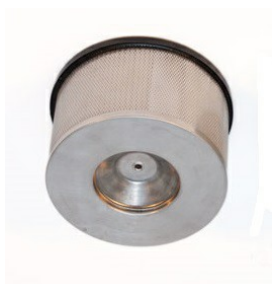
Upstream HEPA Filter - Included