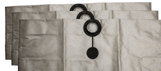
Conductive Recovery Bags - included