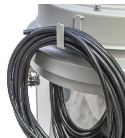
Cable Holder Hook included on the side of the powerhead