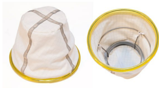
Main Cloth Filter with Cage, Static Dissipative - Included