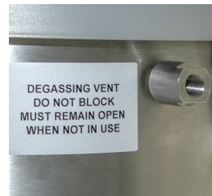
Degassing Vent - Included