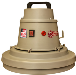
Longer Life Brushless Motor Available (always with 2 x H14 HEPA filters)