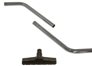
Optional 3D Tools