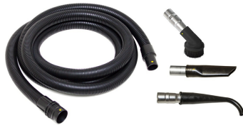
3D Tool Kit for 60 mm suction inlet - included