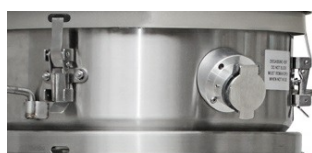
Degassing Vent - Included