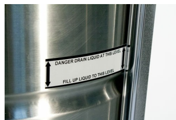
Liquid Level Indicator Tube - Included