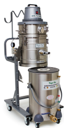
2D-15 (IT-63L) with Recovery Tank removed