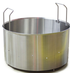
Sieve Basket - Included