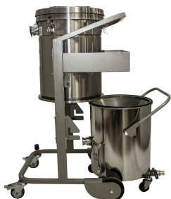
Mini Enhanced - Side View with detachable tank