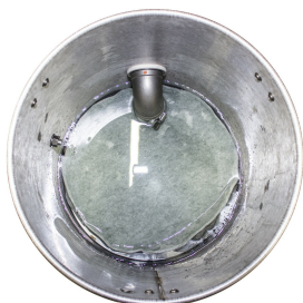
Conductive "wet" recovery bag - Included