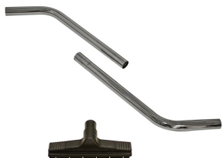
Optional 3D Tools