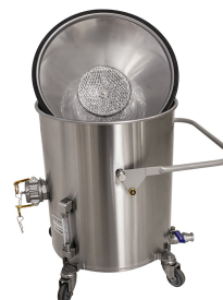
Cone assembly and detachable recovery tank with liquid level indicator and drain valve - Included