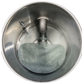
A Conductive "Wet" Recovery Bag can be used in conjunction with the Immersion Bath to facilitate material recovery and emptying