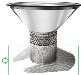
#228093 - Depressor cage for conductive wet recovery bag - optional