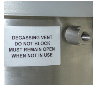
Degassing Vent - Included