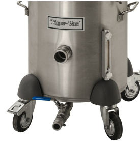
Liquid Level Indicator and Drain Valve - Included