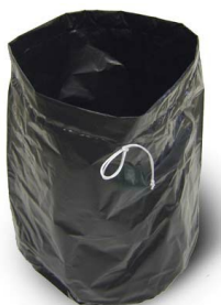
Conductive Polyliner Recovery Bag - Included