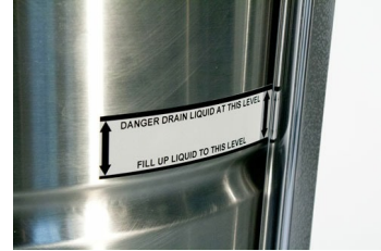
Liquid Level Indicator Tube - Included