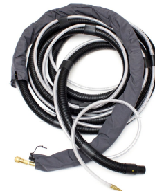
Suction/Airline Hose Assembly, Static Dissipative and Conductive - Included