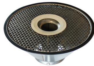
Cone for Interceptors - Included