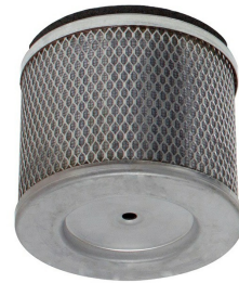
Coalescing HEPA filter (Upstream) - Included