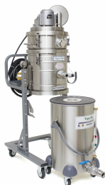
EXP1-IT (63L) with Recovery Tank removed