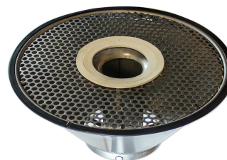
Cone for Interceptors - Included