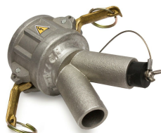
Wye Connector - Included