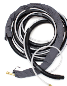
Suction/Airline Hose Assembly, Static Dissipative and Conductive - Included