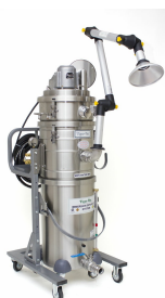
EXP1-IT (63L) with optional Dust Extraction Arm