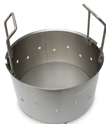
Sieve Basket - Included