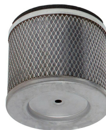
Coalescing HEPA filter (Upstream) - Included