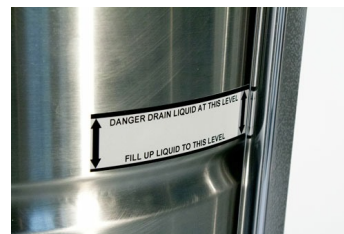
Liquid Level Indicator Tube - Included