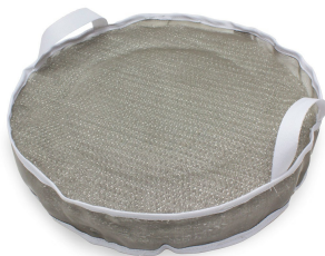
Mist Arrester Pack - Included