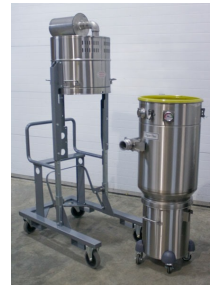
CD/EUR-50L EX DT with Recovery Tank and Filter Chamber removed