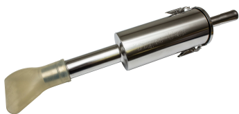
Needle Trap - Optional