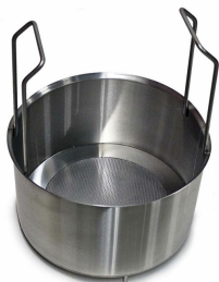
CWR-10 (PHARMA) Sieve Basket - Included