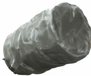
Stainless Steel Mesh Filter - Included