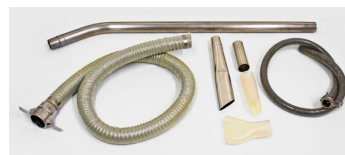
CWR-10 (PHARMA) Tools and Accessories - Included