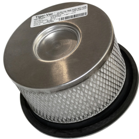
ULPA filter for MV-1CR (HH) - individually laser tested