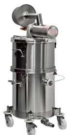
SS-10/15 CR (MRAC)