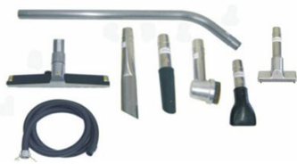
Ø2" (Ø50 mm) Static Dissipative Tools and Accessories - Optional