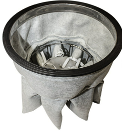
Conductive Star Shaped Filter with Cage - Included