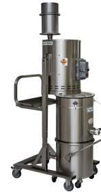
CD/EUR-36L EX DT (MFS) ULPA SS with Recovery Tank and Filter Chamber removed