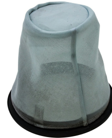
Liquid Filter - Included