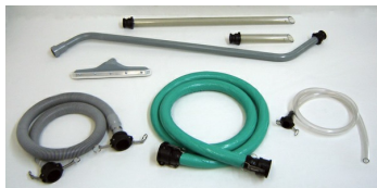
ARU STD Tools and Accessories - Included