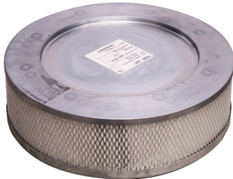
HEPA Filter - Optional