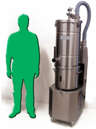
CD-2600 Next to average sized man