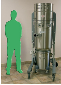
CD/EUR-50L EX DT next to an average sized man