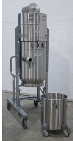
CD/EUR-50L EX DT with Recovery Tank removed