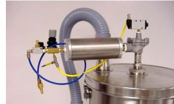
Automatic Reverse Purge Cylinder - Included