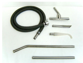
#323604 - Ø1.25" (Ø32 mm) Autoclavable tools and accessories (Kit #3) - Optional