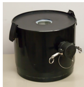
Safe containment canister - Included