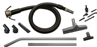
# 323602 - Ø1.25" (Ø32 mm) ESD safe tools and accessories (Kit #2) - Optional