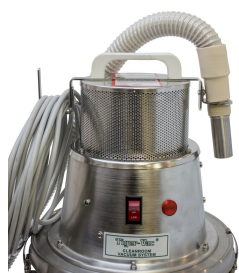
Stainless steel holding bracket - Optional