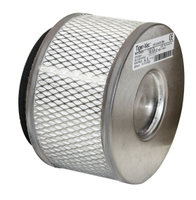
ULPA Filter - Included