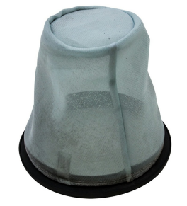
Liquid Filter - Included