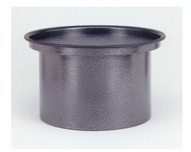
Activated Carbon Cartridge - Optional

Tel: 1-800-668-4437 (954-925-3625) Fax: 1-800-668-4439 (954-925-3626)