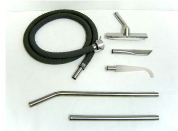
(Kit #3) - Optional