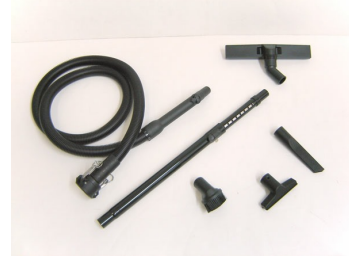
# 323600 - Ø1.25" (Ø32 mm) Standard Tools and Accessories (Kit #1) - Optional