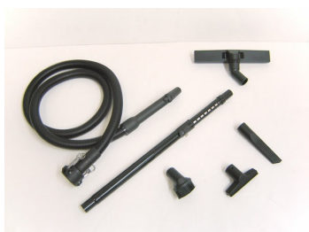
# 323600 - Ø1.25" (Ø32 mm) Standard Tools and Accessories (Kit # 323602 - Ø1.25" (Ø32 mm) ESD safe tools and accessories (Kit #1) - Optional