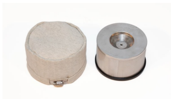
HEPA Filter with Safety Filter - Included