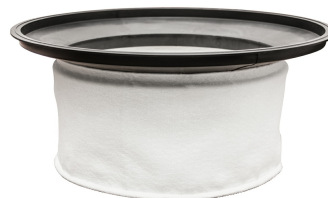
Main Cloth Filter - Included