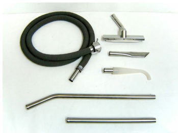
#323604 - Ø1.25" (Ø32 mm) Autoclavable tools and accessories (Kit #3) - Optional