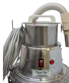
Stainless steel holding bracket - Optional