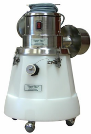
CWR-8 Poly Tank