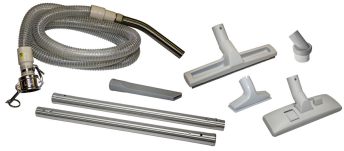
CWR Tools and Accessories - Included