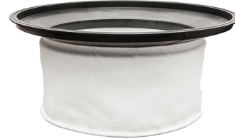
Main Cloth Filter - Included