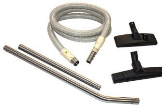
MV-1CR Tools and Accessories - Optional