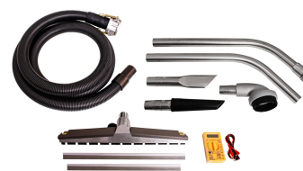
CD-120V/230V Tool Kit - Included