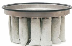
Filter Tubes Assembly for MRPFT models - Included