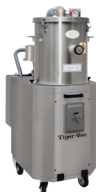
CD-120V EX (CFB) PHARMA