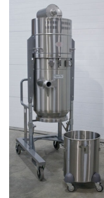
CD/EUR-50L EX DT with Recovery Tank removed