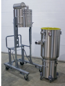
CD/EUR-50L EX DT with Recovery Tank and Filter Chamber removed