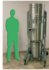
CD/EUR-50L EX DT next to an average sized man