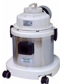
CR-1 ULPA with Stainless Steel Recovery Tank