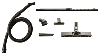
A complete tool kit is included (Part No. 323495)