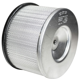
ULPA Filter for CR-1 ULPA - Included