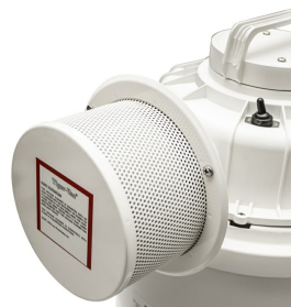
#214860 HEPA/ULPA Filter Protector/Housing Kit - Available