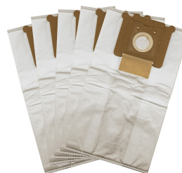
A package of 5 synthetic recovery bags is included (Part No. 212500)