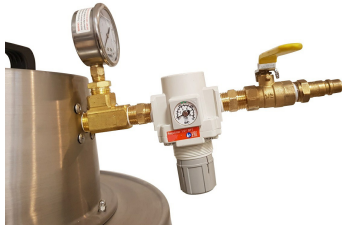
Pressure Regulator - Included