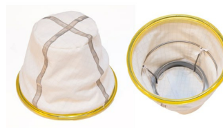
Main Cloth Filter with Cage, Static Dissipative - Included