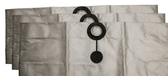
Conductive Recovery Bags - included