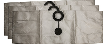
Conductive Recovery Bags - included