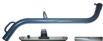
70 mm static conductive tool kit - Included