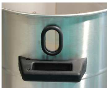
Sight Glass on Recovery Tank