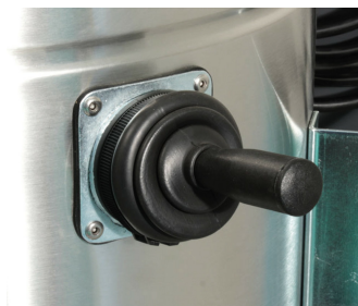
Side Mounted Manual Filter Shaker