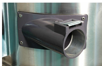
Tangential Suction Inlet, 70 mm, Aluminum