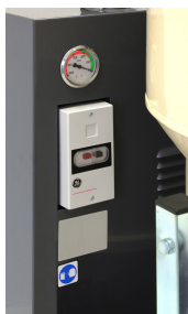
Filter Blockage Indicator Gage. Manual Starter with Overload Protection