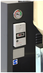
Filter Blockage Indicator Gage. Manual Starter with Overload Protection