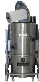
HEPA Filter - Included