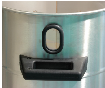
Sight Glass on Recovery Tank