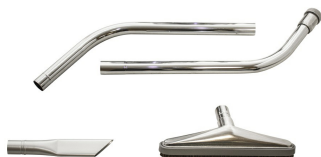
Ø1.5" (Ø38mm) Static Conductive Tool Kit for Single Venturi Models - Included