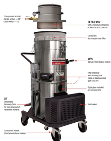
AVSD-1/2 (60L/100L) System Overview