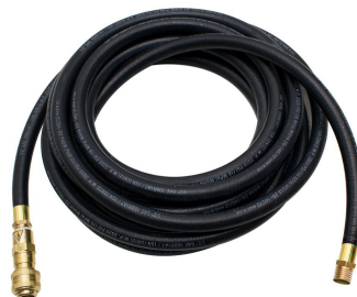
Static Conductive Air Supply Hose - Included