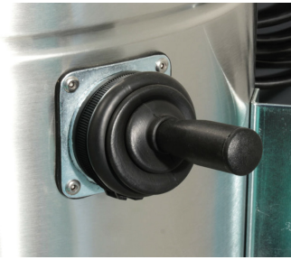
Side Mounted Manual Filter Shaker