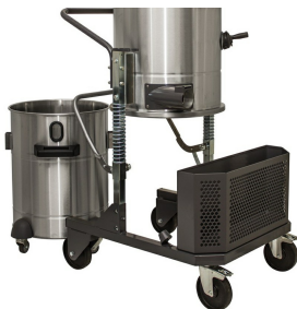
Detachable Recovery Tank for easy emptying