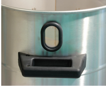
Sight Glass on Recovery Tank