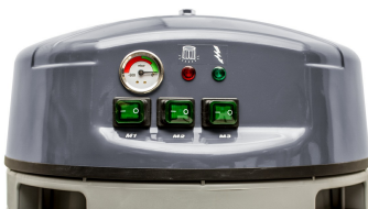
Independent Control for each motor. Pressure Gage and Filter Blockage Indicator