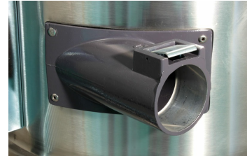
Tangential Suction Inlet, 70 mm, Aluminum