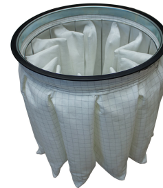
Conductive Star Shaped Filter with Cage for ORDLOC 652 - Included