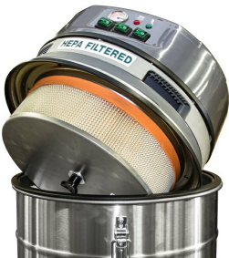
HEPA Filter Cartridge - Included