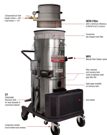
AVSD-1/2 (60L/100L) System Overview